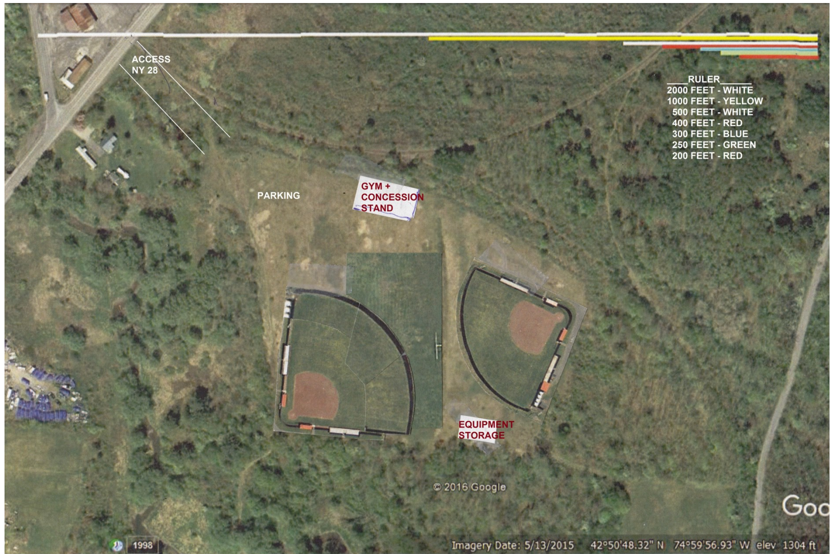
Map 1 - Satellite view of proposed development by RYS of COIDA parcel 24.00-1-18.31 in the Town of Richfield. The COIDA parcel is a safe, 3/4-mile walk from the school. This depicts a baseball diamond (left), a softball diamond (right) and soccer fields.